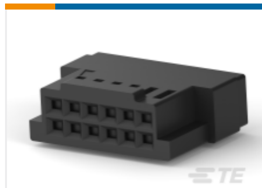
TE Part # CAT-F439-R2435254 2.54mm FFC Connectors Receptacle Housing