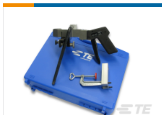
TE Part # 1-528013-1 FFC PISTOL GRIP HAND TOOL CASE