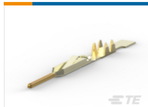
TE Part # 88117-9 FFC PIN CONT 15AU RL