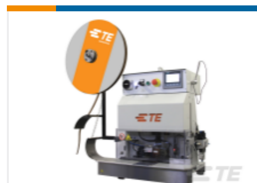
TE Part # 2394880-3 FFC BASE MACHINE MARK II, ENGLISH