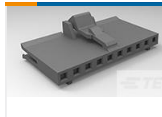
TE Part # 1-487526-8 019 HOUSING FFC RCPT 100CL SR